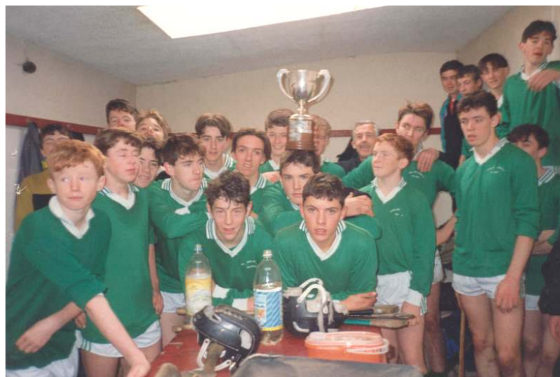
The Players Celebrate in the Dressing Room after the County Champions Win