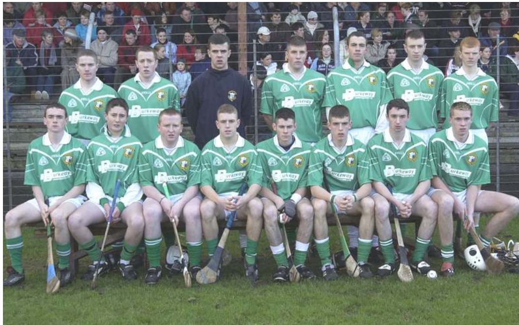
Liam Mellows 2003 Galway County Minor 'A' and City League Hurling Champions

However, that team really came good In 2003 when they won the minor A final with a great win over Sarsfields. They also won the Minor City League in 2003 with a big win over Ardrahan.