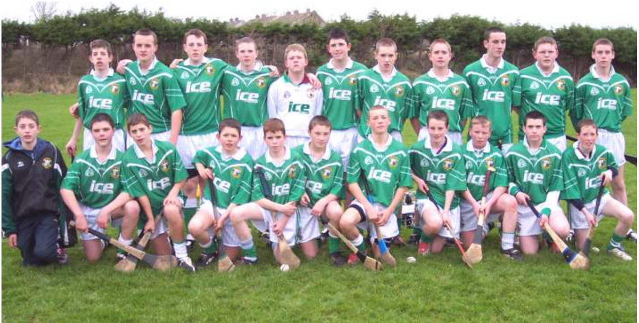
The 2004 Under 14 Panel that Lost the Final to Brian Dillon's in the Brian Dillon's Tournament. The Final was Played in Ballyloughane.