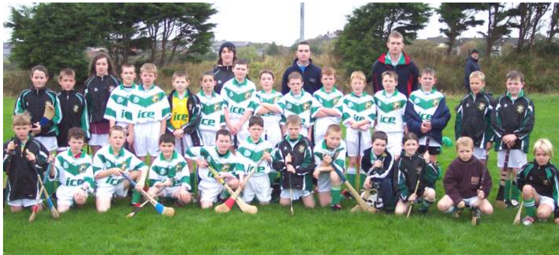
2004 Under 10 Team that Lost to Turloughmore in the Barna/Furbo Tournament Final.

The under 10 team was again unlucky to lose out to Turloughmore in the final of the Barna/Furbo tournament for the second year in a row after a great contest where they had most of the play but failed to convert it into scores.