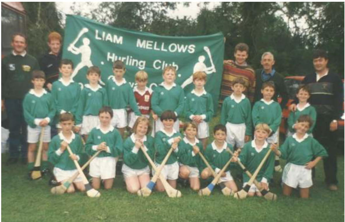
Under 10 Panel that took part in the 1996 Nesson Tournament

In 1996 , the club's U-10 team finished runners-up in the Nesson Tournament held in Limerick, which included teams from Offaly, Clare, Limerick and Waterford.