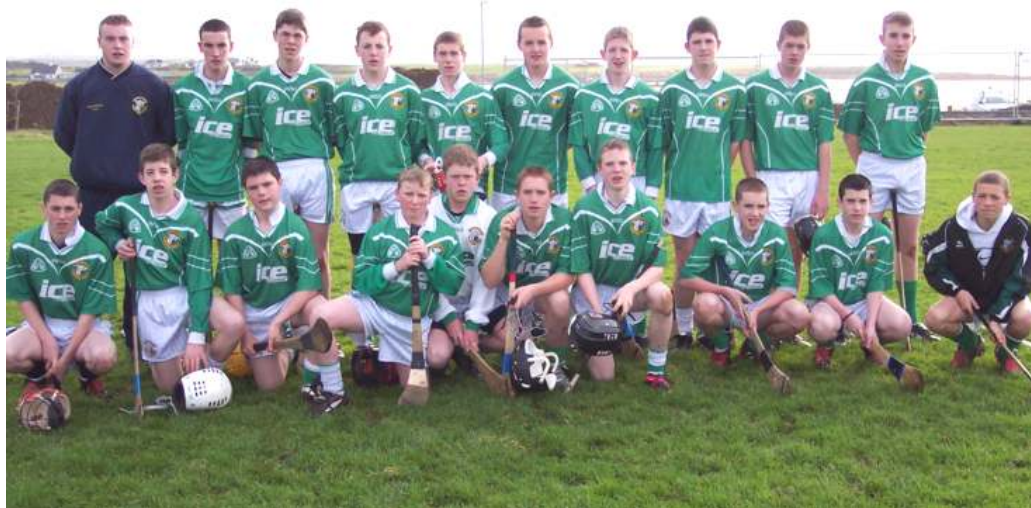
The Under 15 Team that Played Carnmore in the 2004 City League Semi-Final.

Also in 2004 a fine under 15 team was narrowly defeated by Micheál Breathnachs in the City League final. Mellows made a slow start to the game and were three goals behind before they began to play like they can. They produced a great second half but time ran out on them leaving Breathnachs the victors by two points.