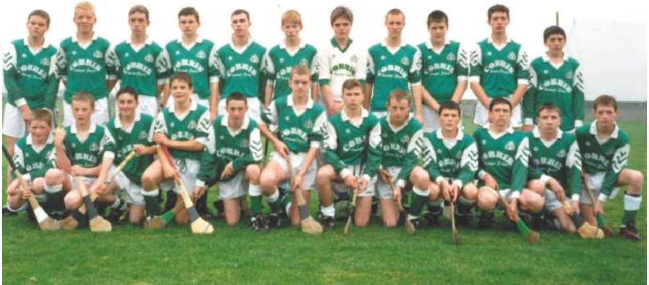
1998: Under 16C County Champions Defeated Mountbellew-Moylough in the Final